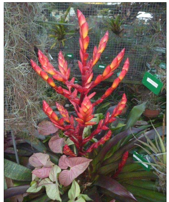
xVriecantarea 'Fever Dream'

Its natural habitat is Florida, West Indies, Mexico, Central America to northern Peru and Brazil. Before the Mexican bromeliad weevil did so much damage, large, dense, localized populations could be found in deep swamp habitat,