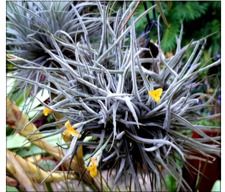
My sweet little Tillandsia crocata blooming outside the back door.

This is a publication for the East London Bromeliad Society, South Africa for the interest of its members. Articles may be used by non profit societies with acknowledgement to the author where applicable and East London Bromeliad Society South Africa. Please use the photos that accompany the article used. If you require higher resolution photos please request them from the Editor.