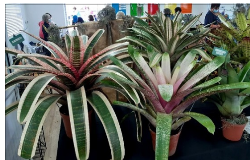
Much admired Vriesea hybrids on show.